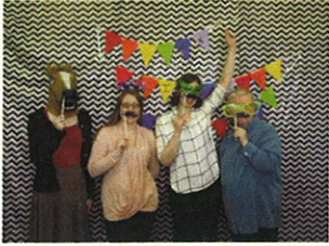
FPL staff ready for Summer Read!