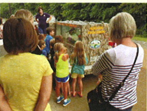
Fish tank @ FPL