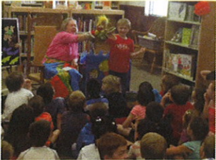
Participating in Story Time